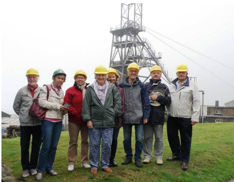
Twins at Gevor Tin Mine, Cornwall, and...