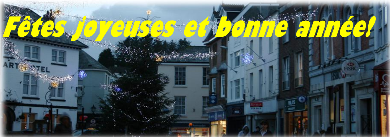
Christmas lights twinkle as shoppers head home through Launceston Square at nightfall